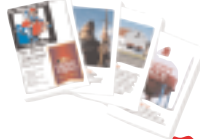
Historic Mailboat Live Theater May-August 2008 Weekly outdoor performances